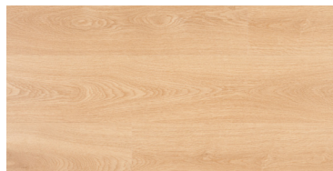
Hakone Oak GLADES100