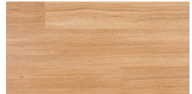
Tamanu Spotted Gum GLADES080