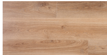
Acer Oak GLADES030