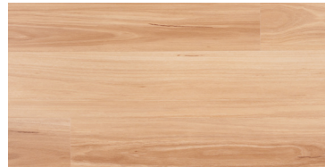
Chiku Blackbutt GLADES070