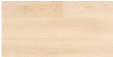
Kuri Oak GLADES050