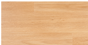
Yoshino Spotted Gum GLADES090