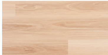
Serisa Blackbutt GLADES060